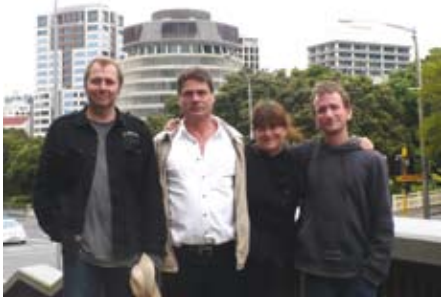
Our first visit to parliament