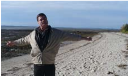
A lovely spot for a script run through ...