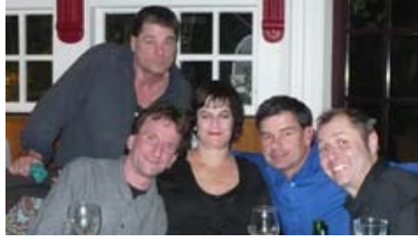
Shanghai Lil - great jazz, great company, not so great tapas