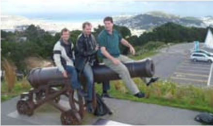
Fun in Wellington