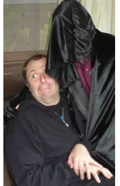
Some people just don't read the instructions!